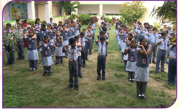
Morning Assembly - Shoulder Exercise