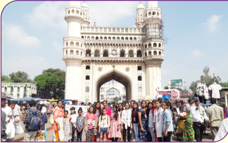
Educational Tour (Charminar, Hyd.)