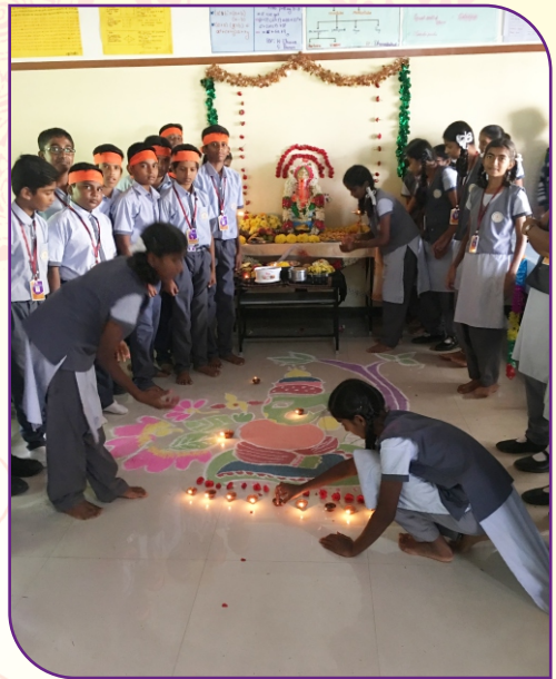
CCA (Vinayaka Chavithi)