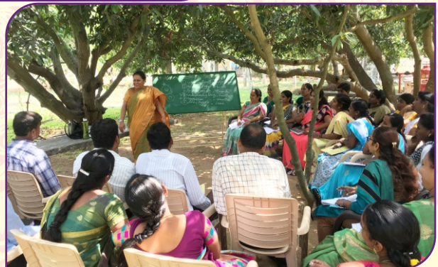
Teacher's Orientation Programme - SSPYV