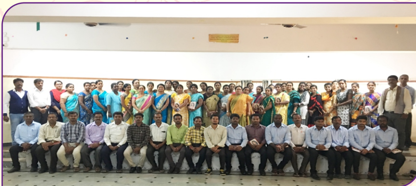
Teacher's Orientation Programme