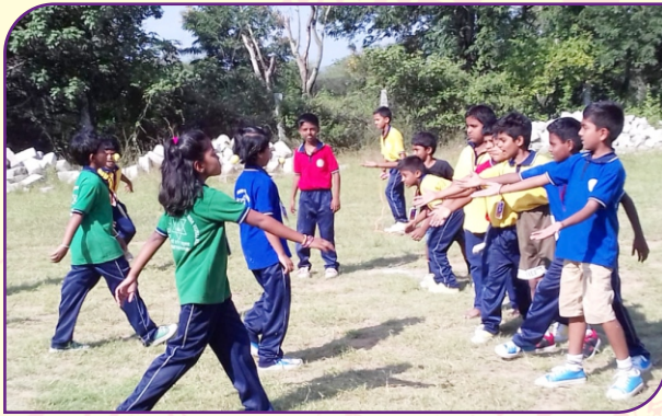
Sports Day (Lemon & Spoon)