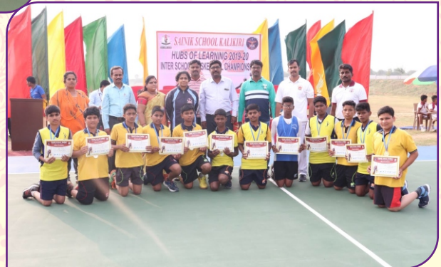
Basket-Ball Runners (Sainik School - Kalikiri)