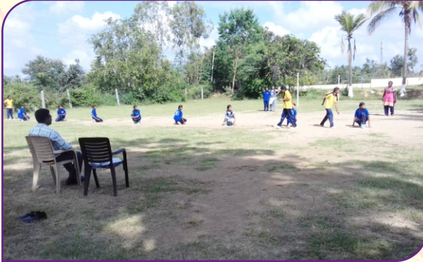
Kho-Kho (Jr. Girls)