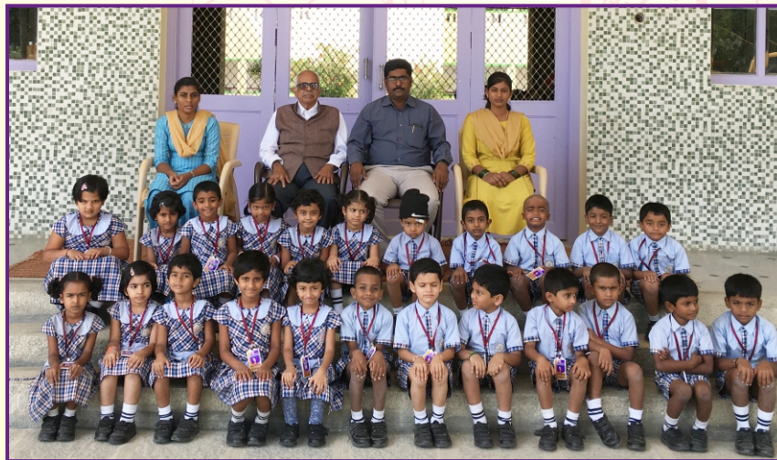
U.K.G - (B) Section