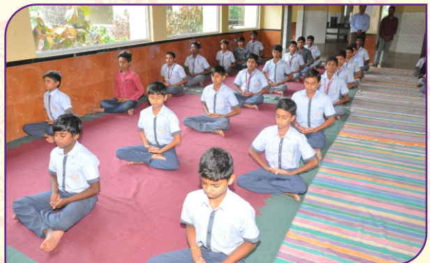
Yoga & Meditation