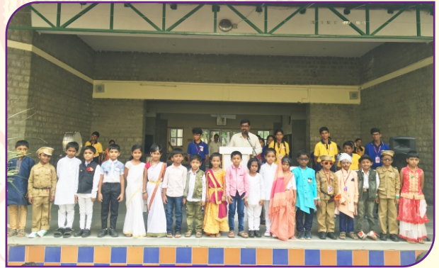
National Leader's Fancy Dress Competition