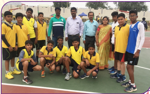
Basket-Ball (Sainik School)