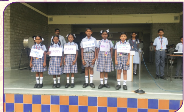
Golden Words -Skit