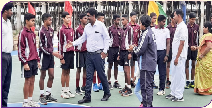
Principal of SSPYV wishing students before Basket-ball Match (Kalikiri)