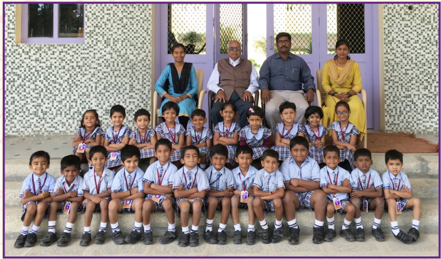
U.K.G - (A) Section