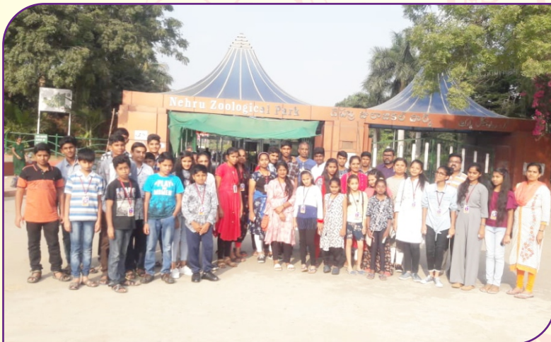
Educational Tour (Nehru Zoological Park, Hyd.)