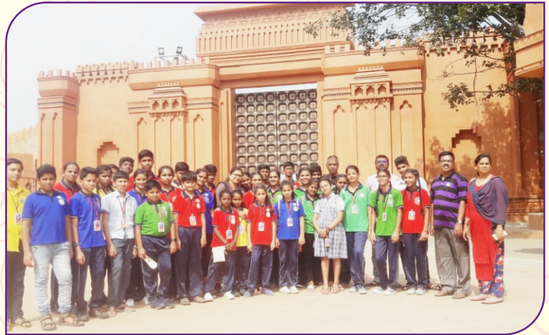
Educational Tour (Ramoji Film City, Hyd.)