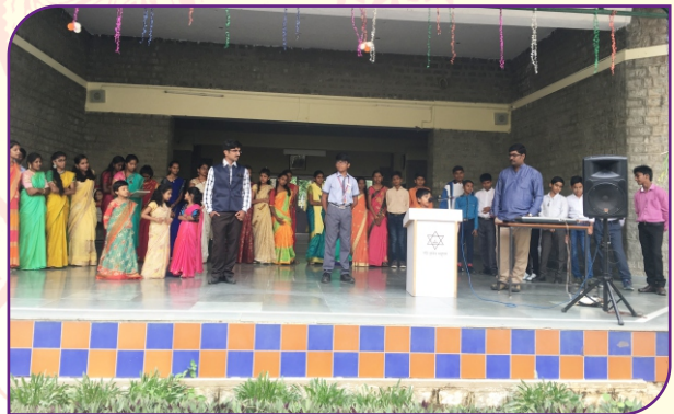
Teacher's Day - Student's Imitation