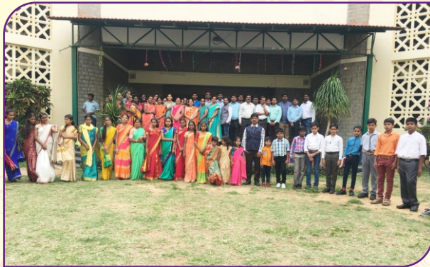
Teacher's Day - Imitation by Students