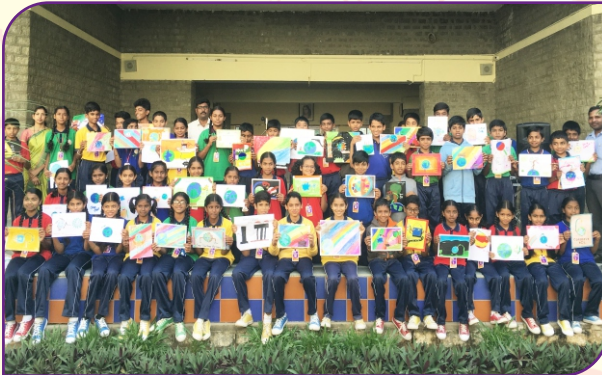
PCRA Painting Competition