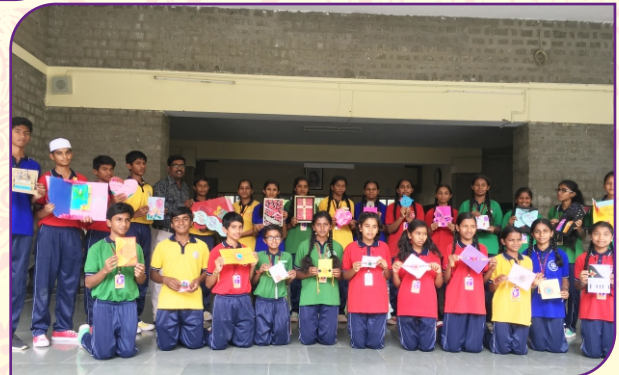
Greeting Card Competition Raksha Bandhan