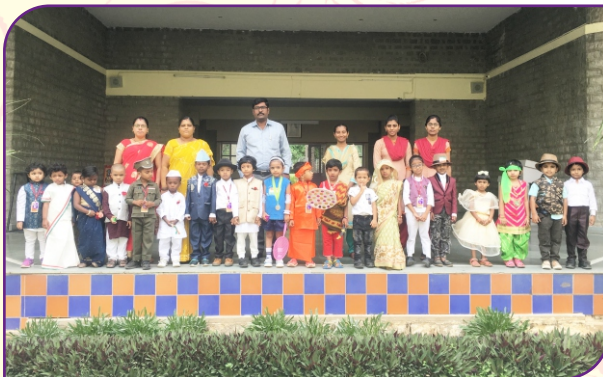
Fancy Dress Competition